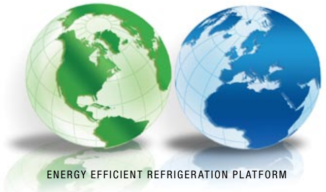
ENERGY EFFICIENT REFRIGERATION PLATFORM

...is two times more energy efficient than machines made five years ago. 40% more energy efficient than competitors.